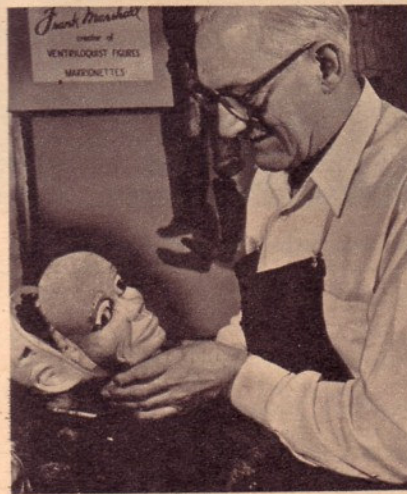
With brain and eyes in place, the two halves of the head are now put together.