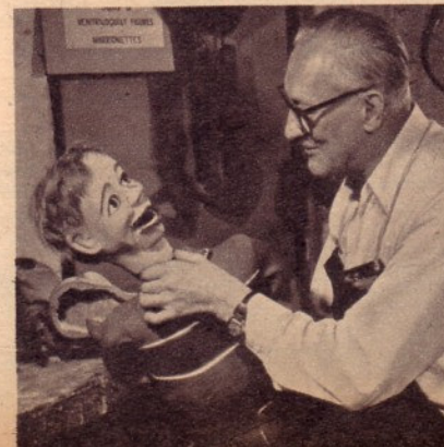
Marshall's most famous creation often comes home for repairs and adjustments.